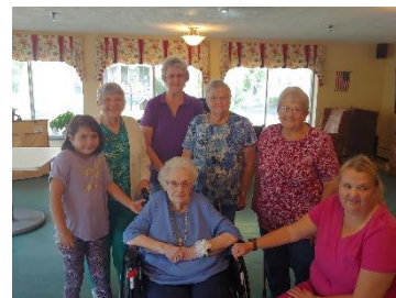
Celebrating the 98 th birthday of Byron's oldest member