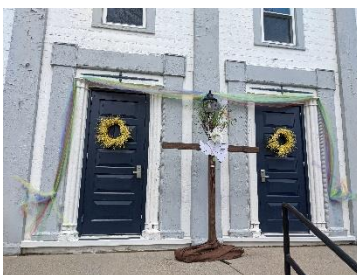
Church doors were decorated for Easter while 120 people worshiped virtually