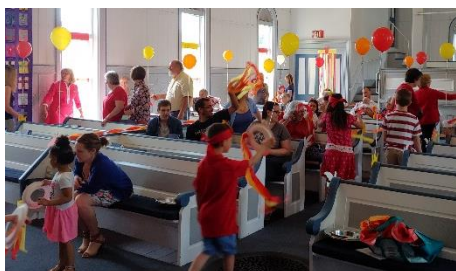
Balloons equal fun for kids at Byron Presbyterian

Two years ago Byron was the recipient of a Presbytery grant which was used to purchase sewing machines and material. These are now being used to make face masks that are given out free to those who need them including area farm workers.