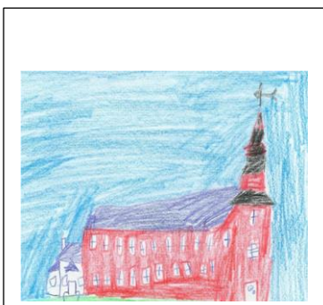
Fellowship Hour after Sunday Worship Service.