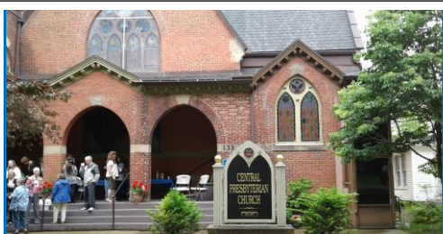
Front Yard fellowship after Worship Service on Sunday June 2 nd /2019